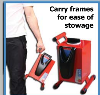
Carry frames for ease of stowage