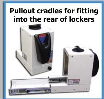
Pullout cradles for fitting into the rear of lockers