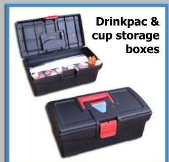
Drinkpac & cup storage boxes