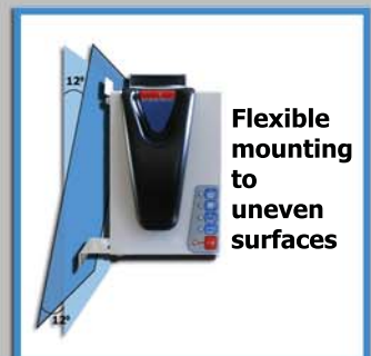
Flexible mounting to uneven surfaces